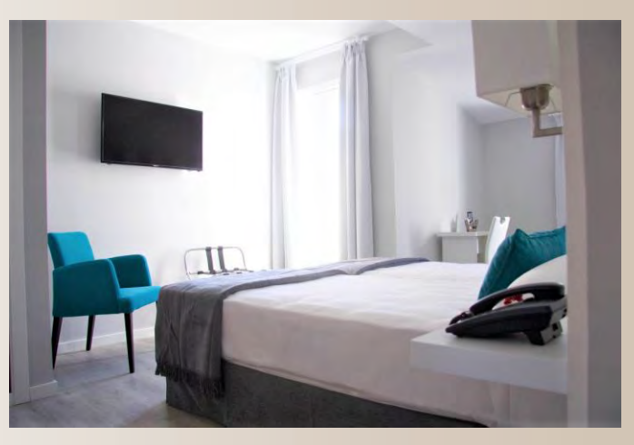
You can book in all the Accommodations of this guide in 1 SINGLE STEP