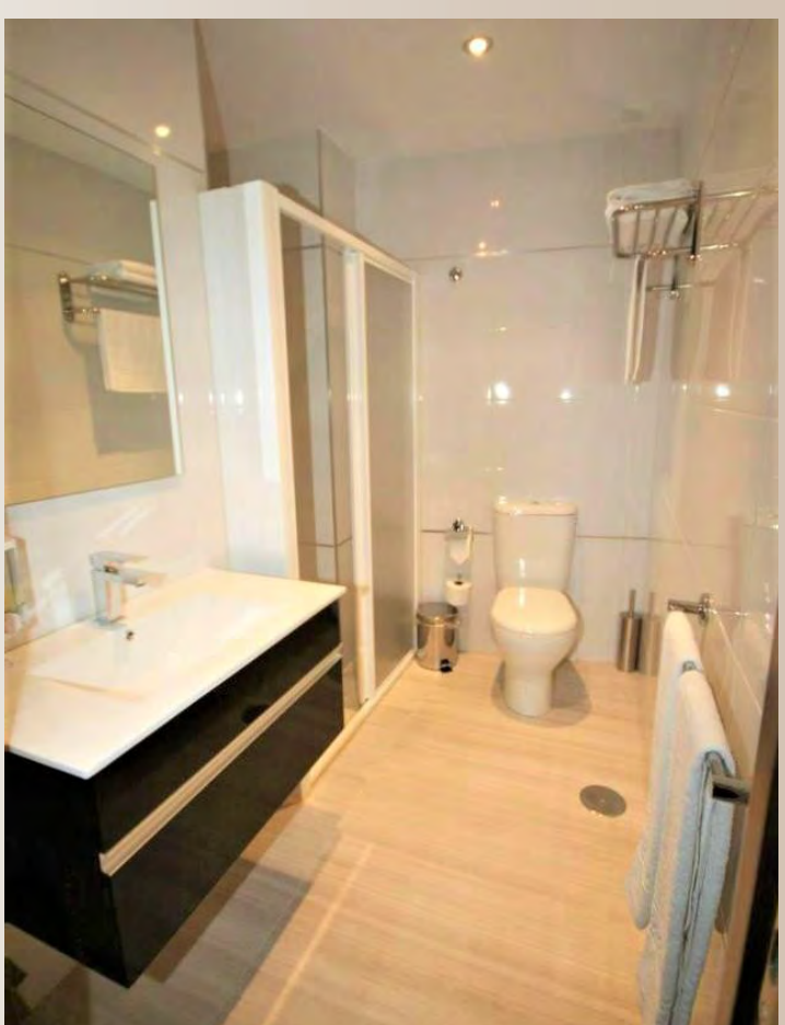
You can book in all the Accommodations of this guide in 1 SINGLE STEP