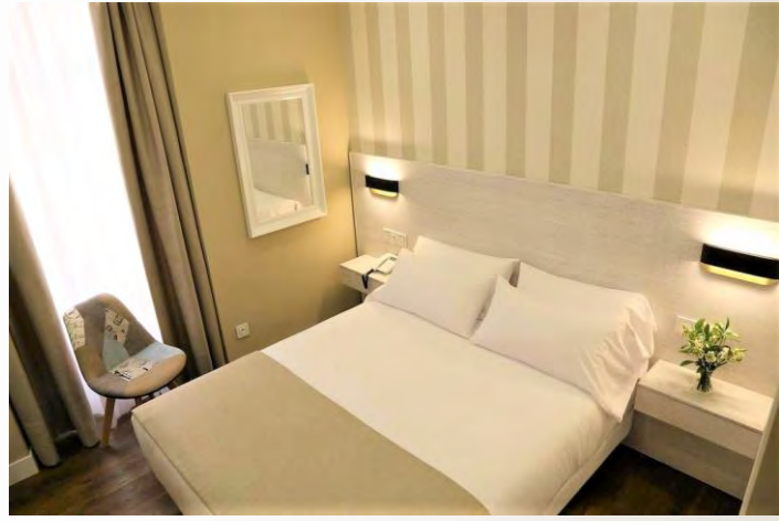
You can book in all the Accommodations of this guide in 1 SINGLE STEP