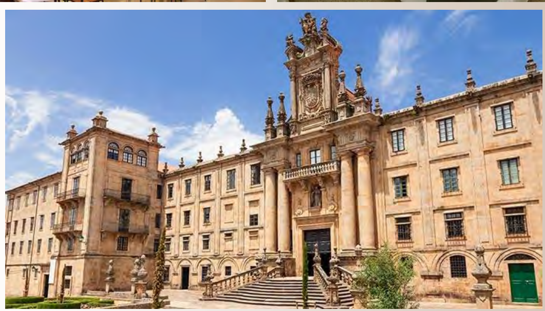
You can book in all the Accommodations of this guide in 1 SINGLE STEP