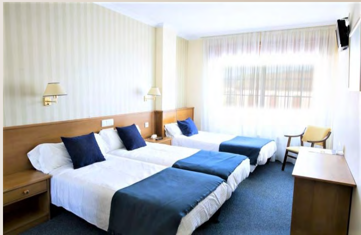
You can book in all the Accommodations of this guide in 1 SINGLE STEP