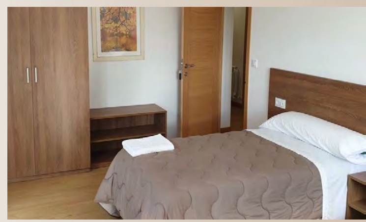
You can book in all the Accommodations of this guide in 1 SINGLE STEP